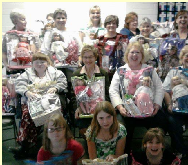
Some of the members had a hard time parting with the dolls!