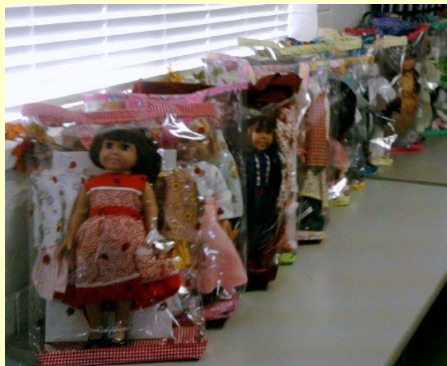
Dolls, packaged and ready to deliver to MetroCrest

Santa was VERY grateful to the Pin-Pals in 2009!