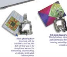
1/4" Quilting Foot Combined with the MC6600P's hand and foot, this foot will keep you in the straight and narrow for quilting, making it easy to stitch in the ditch between pieces.

Our most popular Professional Series model, the MC6600P gives you the speed, precision and flexibility you need for all your sewing and quilting projects.